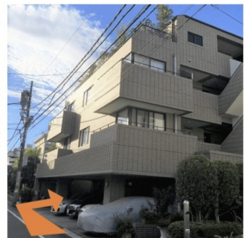
⑨ You will see the sign of "Tokyo Chiropractic" on your right.