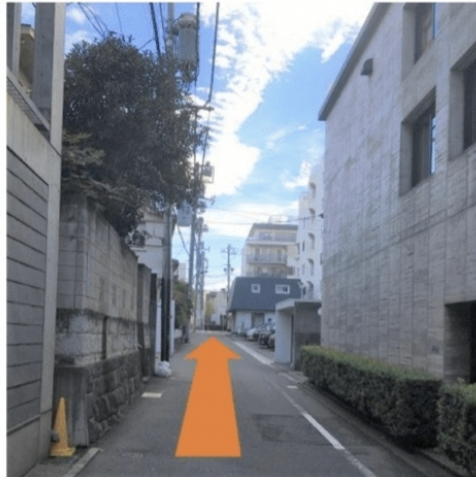
⑤ Walk straight ahead.