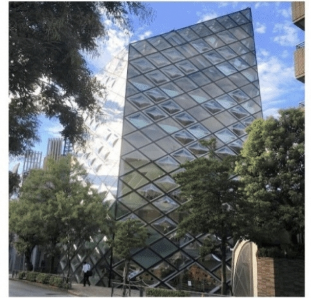
③ You will see the Prada building on your right.