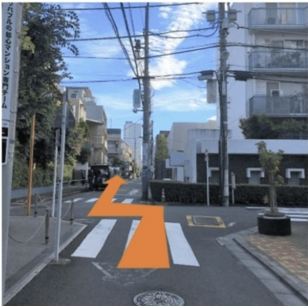
④ Walk straight ahead.