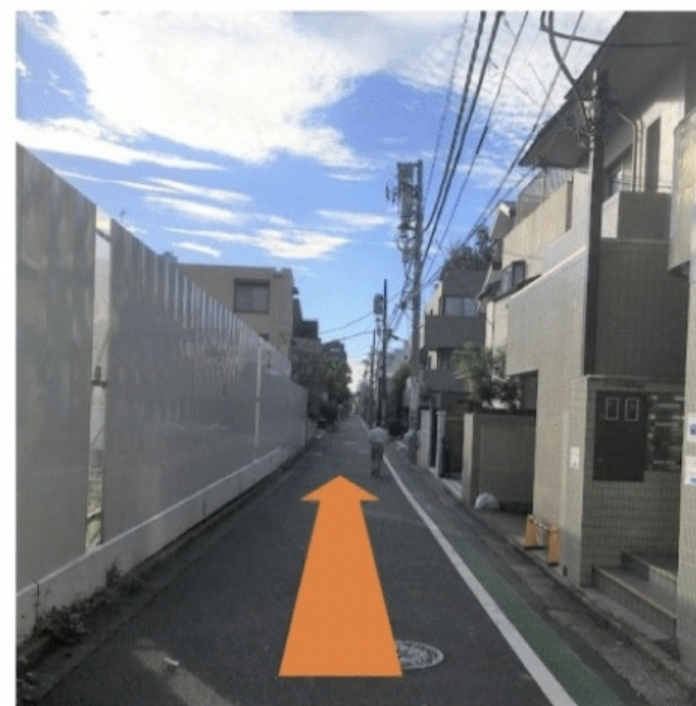
⑧ Walk straight ahead.