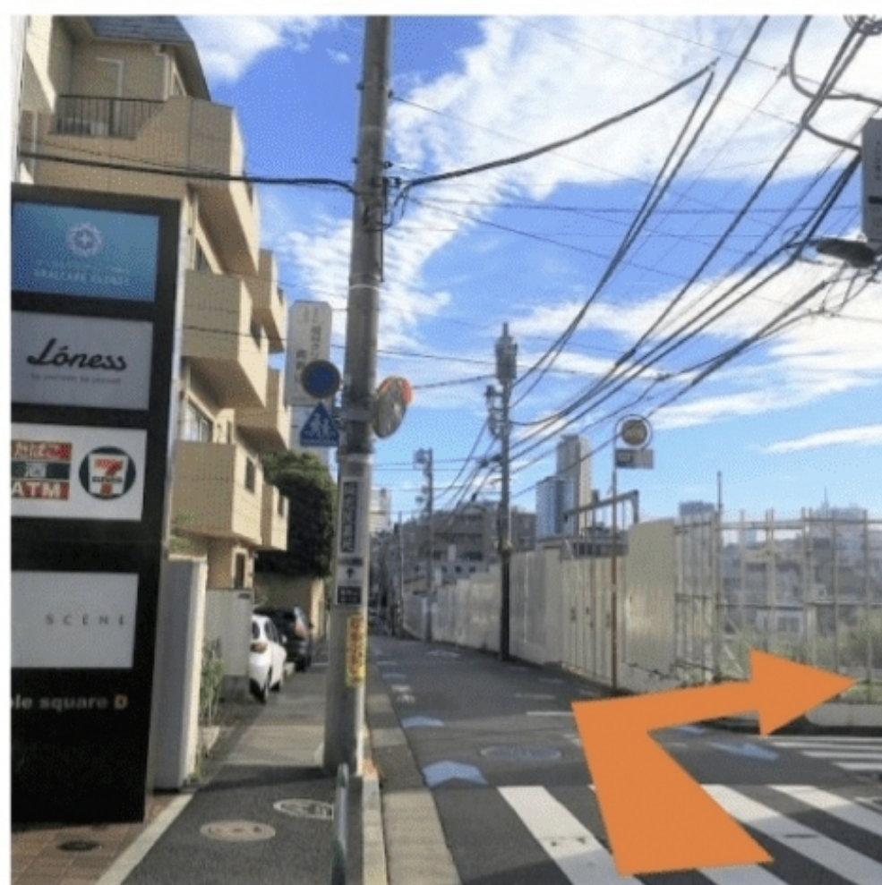
⑦ You will see Seven-Eleven on your left then turn right.