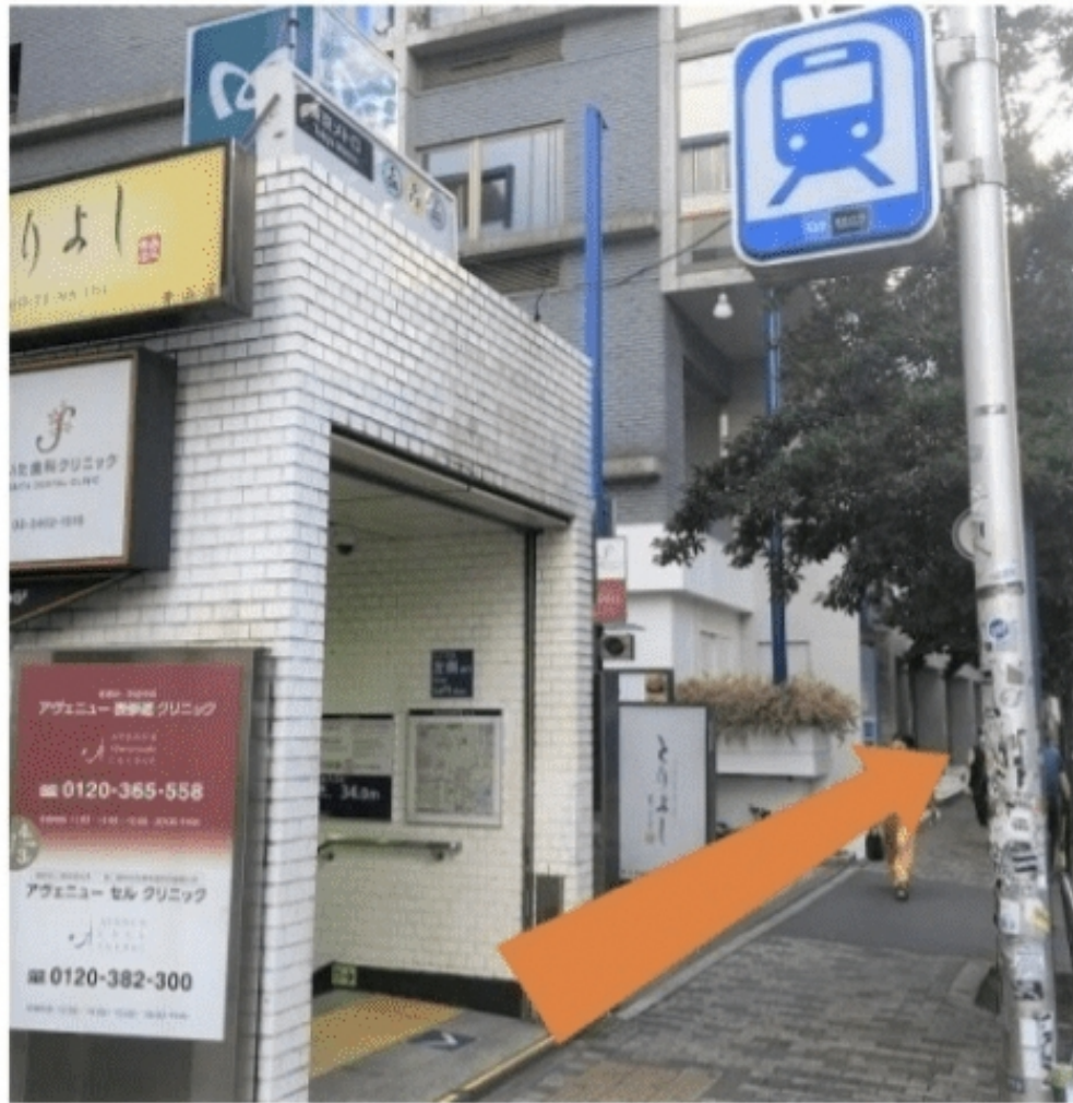
① Leave from Exit A4 and turn left.