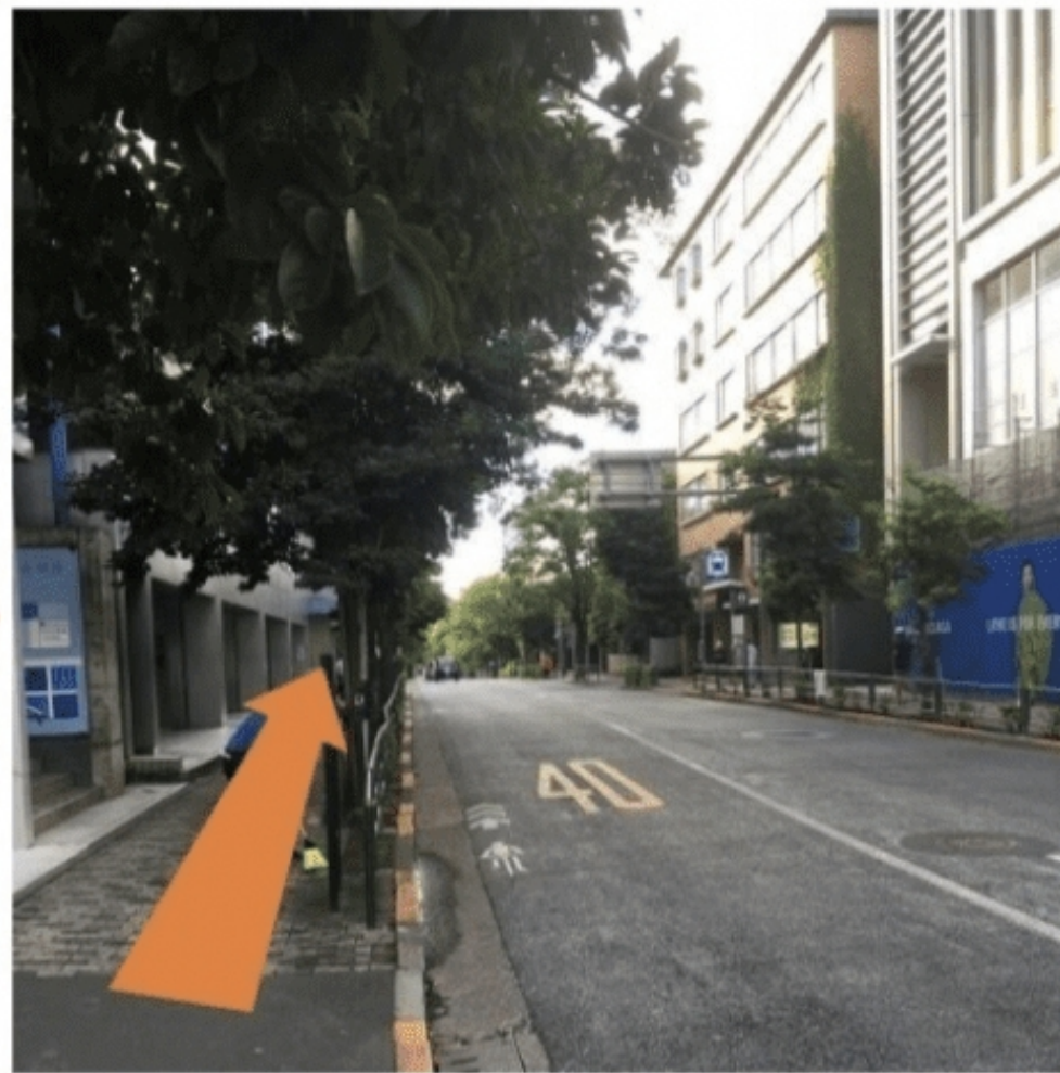
② Walk along the street.